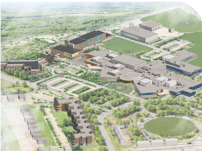
Rendering of future of regional healthcare campus in Moosonee.

Construction has officially started on the new Weeneebayko Area Health Authority (WAHA) regional healthcare campus in Moosonee.