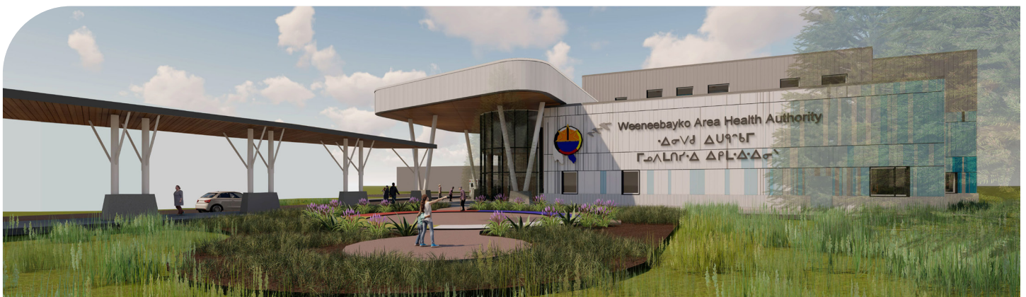
Rendering of future ambulatory care centre in Moose Factory.

The WAHA Redevelopment Project is a oshki kiskinowacihtawin/new beginning for our region. For regular updates on the Redevelopment Project and business opportunities follow the WAHA Redevelopment Project's Facebook page .